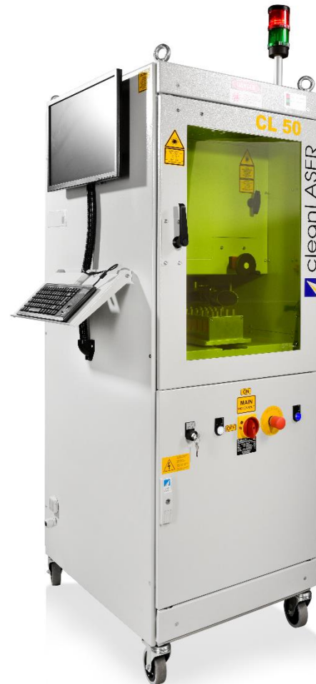
Exterior view of the compactCELL with closed door