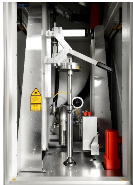
Variable clamping device