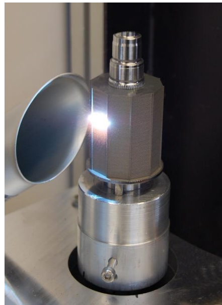
Laser processing rotor