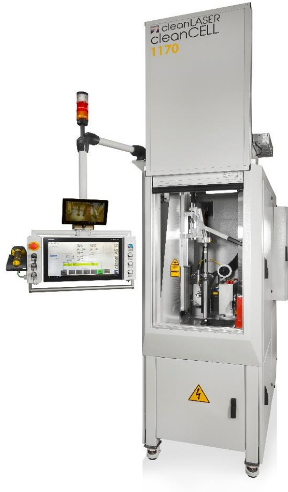
cleanCELL1170 with lifting door